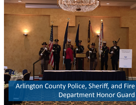
Arlington County Police, Sheriff, and Fire Department Honor Guard

➤ Turn to page 8 for the list of winners, photos, and event sponsors.