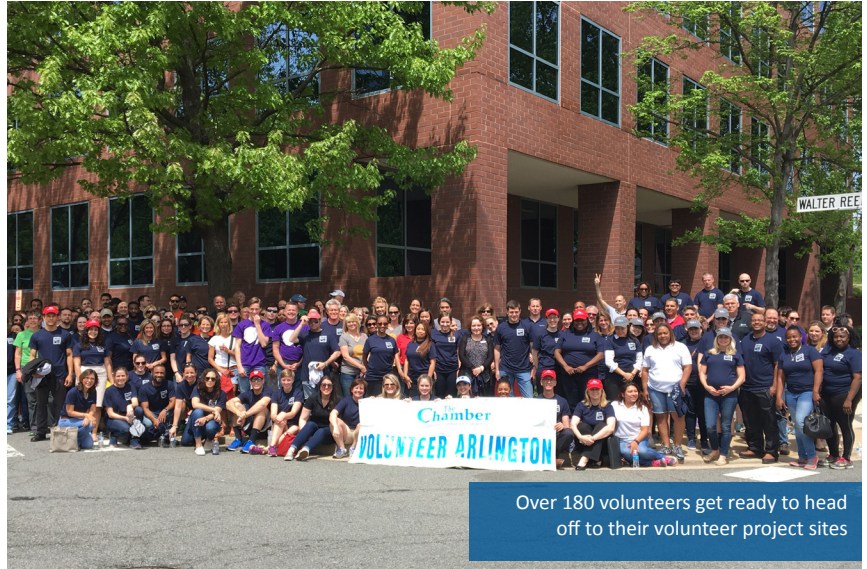
Over 180 volunteers get ready to head off to their volunteer project sites

Volunteers included employees from a variety of industries and businesses in Arlington who dedicated their time and joined in the fun for this event. Arlington nonprofits were excited to have so many enthusiastic volunteers helping at their sites.