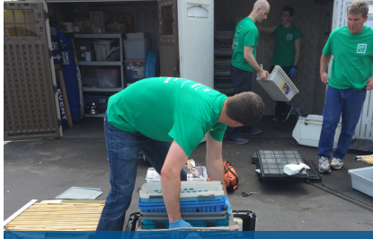
Volunteers from Segue Technologies and Bank of Georgetown organize supplies at Homeward Trails Animal Rescue.

Community Residences Culpepper Garden Homeward Trails Animal Rescue Linden Resources Phoenix Bikes The Reading Connection Red Cross National Capital Region