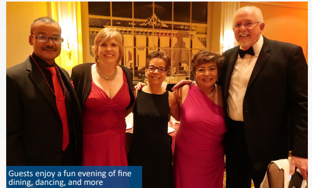
Guests enjoy a fun evening of fine dining, dancing, and more