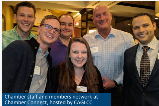
Chamber staff and members network at Chamber Connect, hosted by CAGLCC