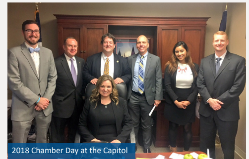
2018 Chamber Day at the Capitol

To be added to the committee distribution list, email chamber@arlingtonchamber.org .