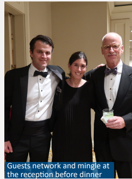
Guests network and mingle at the reception before dinner