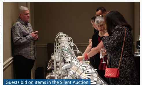
Guests bid on items in the Silent Auction

Photos from the Gala can be found at: facebook.com/ArlingtonChamberVA