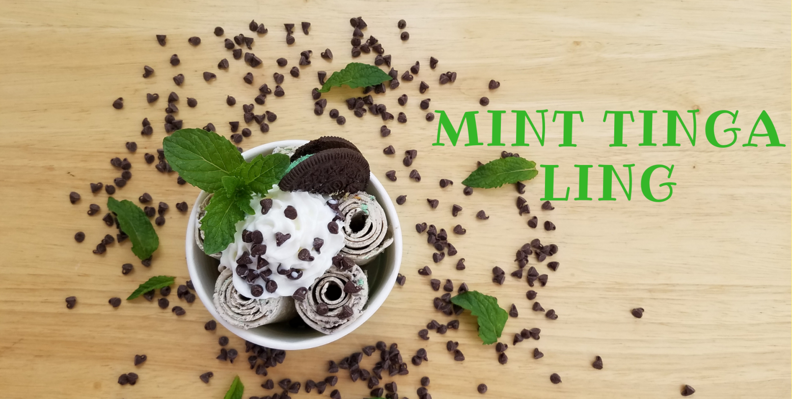
MINT TINGA LING