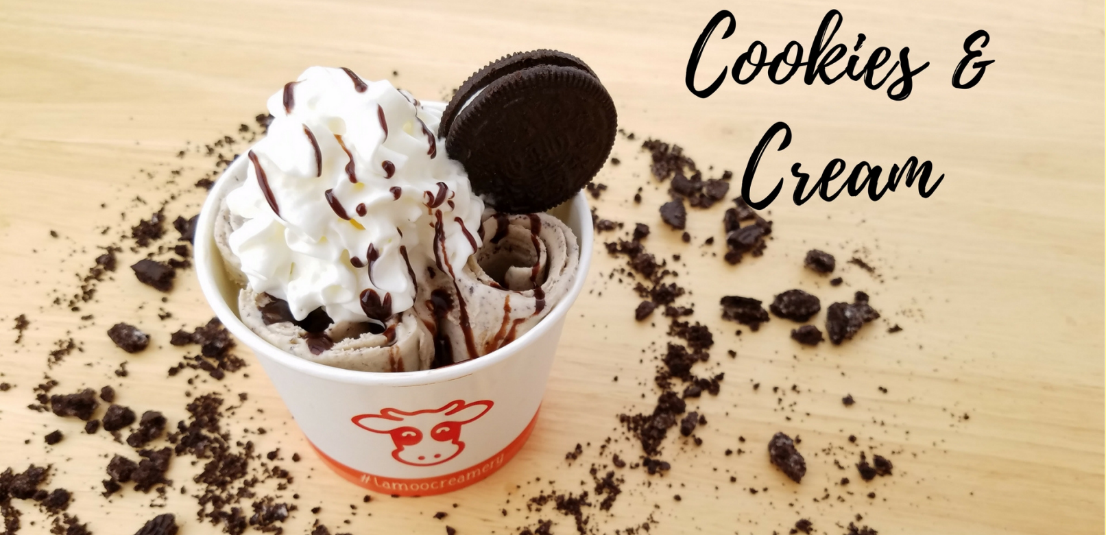
Cookies & Cream