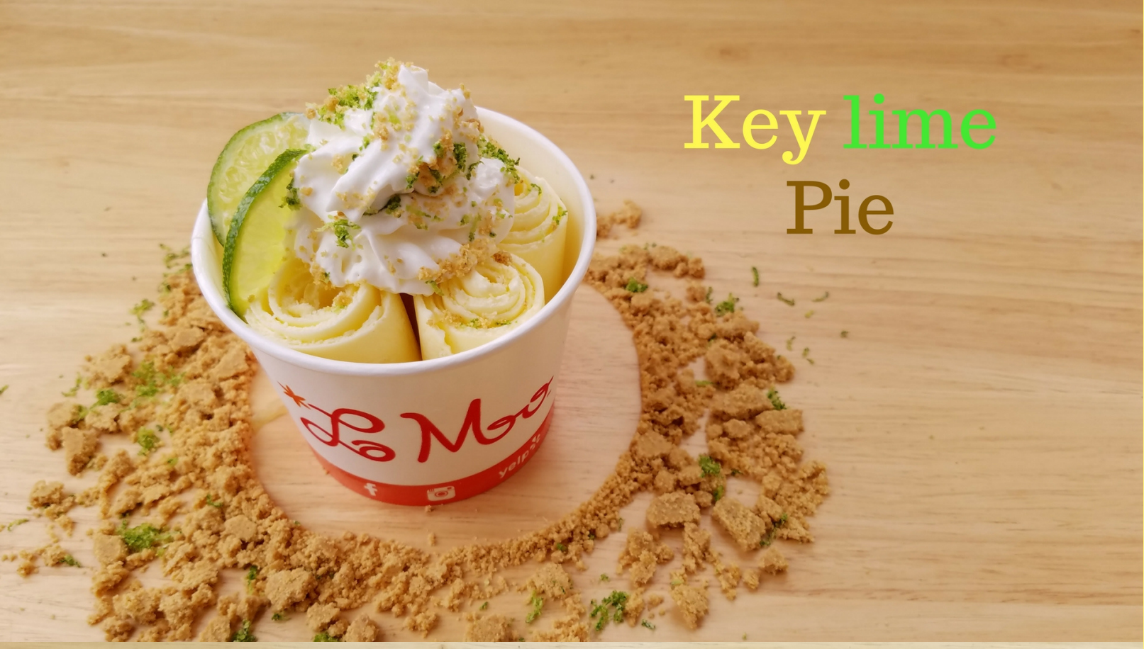
Key lime Pie