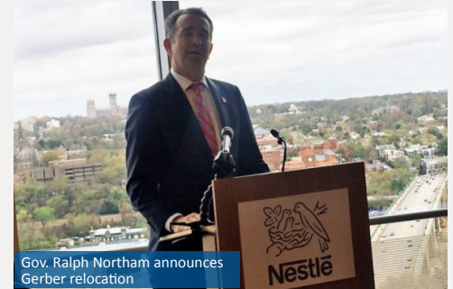
Gov. Ralph Northam announces Gerber relocation

Nestlé's decision to bring one of its top brands to Arlington after choosing just a year ago to locate its headquarters here is a major step forward in Arlington's effort to diversify its economy. Once known as a government suburb, Arlington has taken a concentrated effort in recent years to attract new and different companies to Arlington, specifically those associated with the innovation economy and with a global scope.