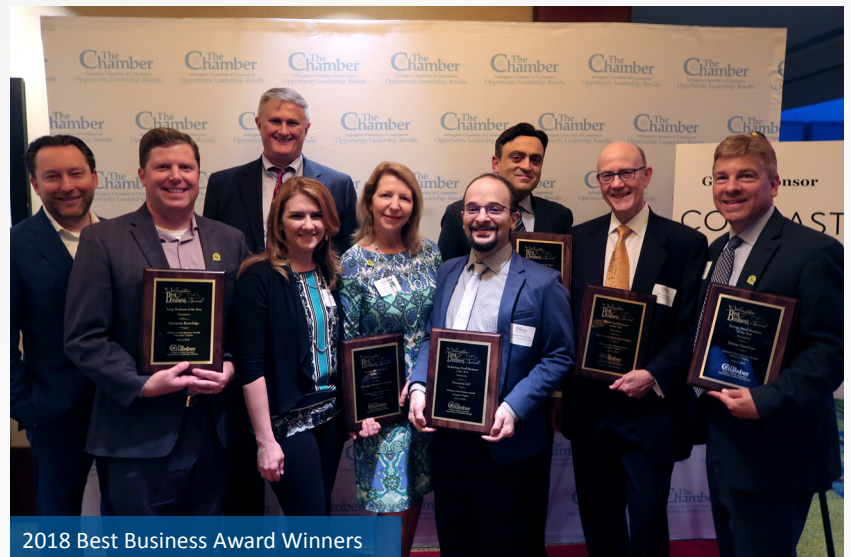
2018 Best Business Award Winners

Photos from the Best Business Awards can be found at www.facebook.com/ArlingtonChamberVA