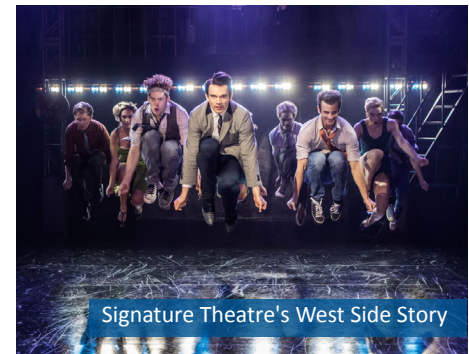
Signature Theatre's West Side Story