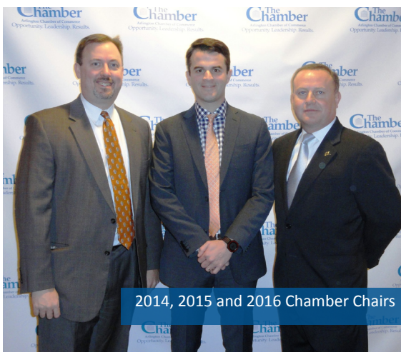
2014, 2015 and 2016 Chamber Chairs