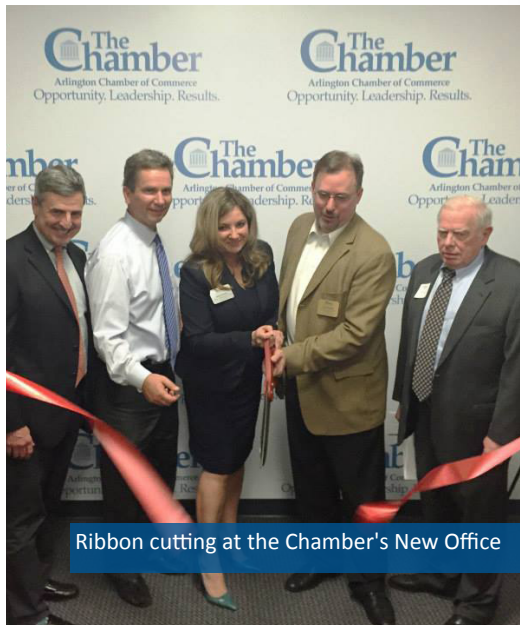
Ribbon cutting at the Chamber's New Office

Rocklands Barbeque and Grilling Company Ruth's Chris Steakhouse Sangam International Catering Windows Catering