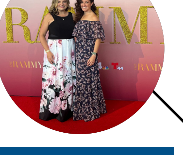
Restaurant Association of Metropolitan Washington's RAMMY Awards