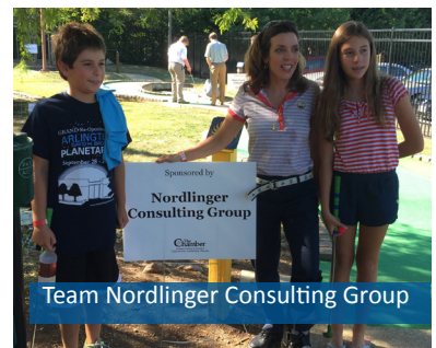
Team Nordlinger Consulting Group