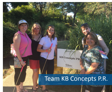
Team KB Concepts P.R.