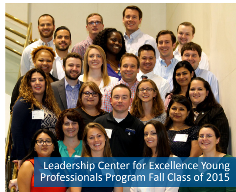
Leadership Center for Excellence Young Professionals Program Fall Class of 2015