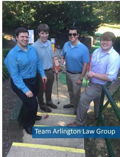
Team Arlington Law Group