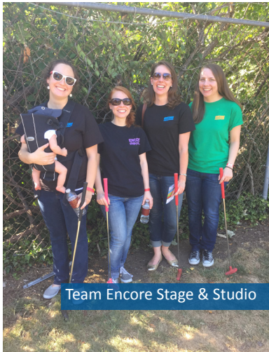
Team Encore Stage & Studio