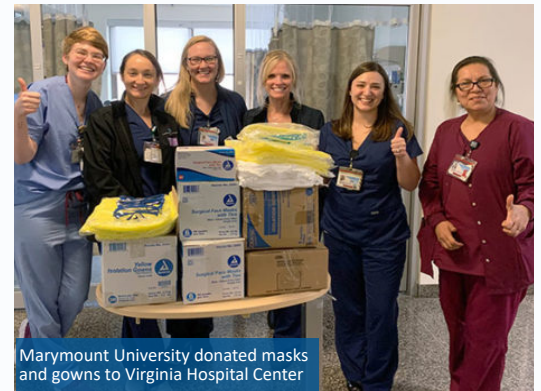
Marymount University donated masks and gowns to Virginia Hospital Center