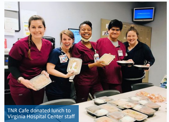
TNR Cafe donated lunch to Virginia Hospital Center staff