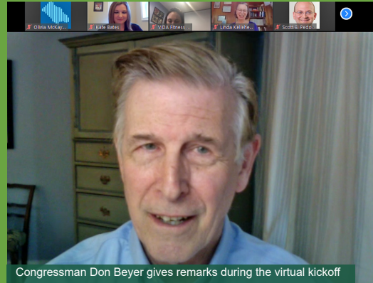
Congressman Don Beyer gives remarks during the virtual kickoff