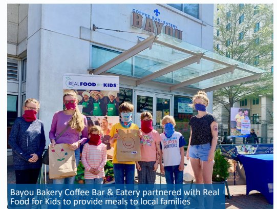
Bayou Bakery Coffee Bar & Eatery partnered with Real Food for Kids to provide meals to local families