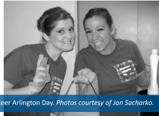
WETA employees help out at A-SPAN for Volunteer Arlington Day.

Employees from a variety of industries and businesses in Arlington volunteered their time and joined in the fun for this event. Participating businesses included: