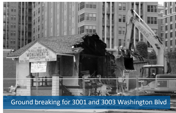
Ground breaking for 3001 and 3003 Washington Blvd

Designed to function as two adjacent buildings, the 3001 and 3003 development includes a 10-story, 200,000 square foot office building that will be largely filled by the 600 CNA employees. With complementary architecture incorporating an existing art deco façade, an 8-story, 80,000 square foot office building will complete the development. The ground level of both buildings will bring 28,000 square feet of retail space to Clarendon. "It is one of the last pieces of major development in Clarendon, helping to more fully realize a balance of live/work options," explained Arlington County Board Chair Mary Hynes, a Clarendon resident of 33 years. "We couldn't be more delighted..." she began to say, as the noise of passing construction trucks interrupted her remarks at least three times. "This is a good sign — the sound of progress!"