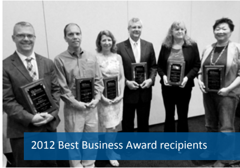
2012 Best Business Award recipients