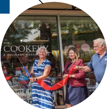
The Cookery's 10 th Anniversary ribbon cutting