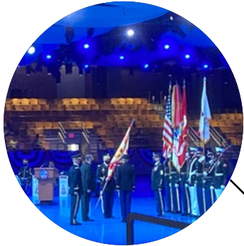
Joint Base Myer-Henderson Hall Change of Command