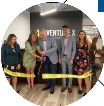
Venture X's grand opening and ribbon cutting