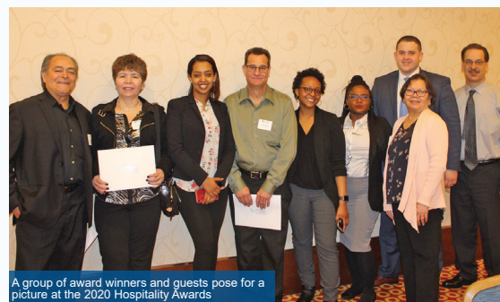
A group of award winners and guests pose for a picture at the 2020 Hospitality Awards