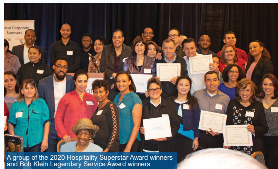
A group of the 2020 Hospitality Superstar Award winners and Bob Klein Legendary Service Award winners