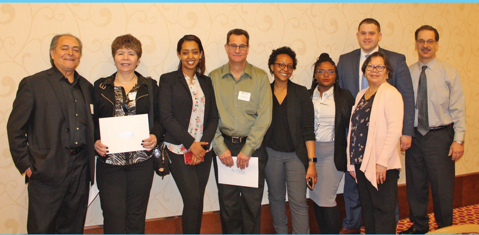
2020 Hospitality Awards

special thanks to ARLINGTONIAN GRAND SPONSOR