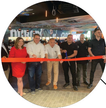
WHINO's grand opening and ribbon cutting