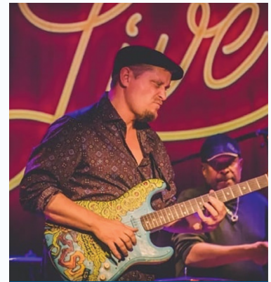
2021 Columbia Pike Blues Festival

The Columbia Pike Revitalization Organization has received a $25,000 donation from its new partner, Amazon . The donation was put toward some of Arlington's favorite events such as the recent Columbia Pike Blues Weekend and the upcoming Columbia Pike Drive-In Movie Nights. The donation will also go toward CPRO's 35th Anniversary Celebration. CPRO was grateful for Amazon's support, and said thanks to Amazon's and others' support, they are able to allocate more of their existing funds to community programs.