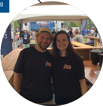
Ballston BID's Bands & Brews on the Boulevard