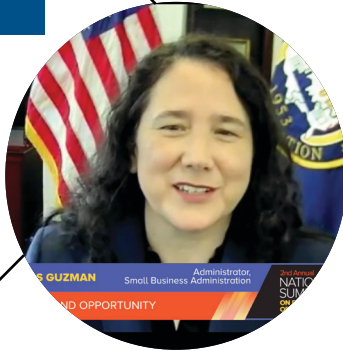
U.S. Chamber of Commerce's National Summit on Equality of Opportunity