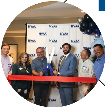
NVAA's grand opening and ribbon cutting