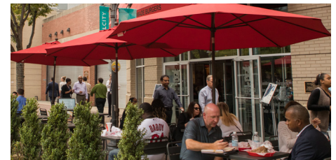
TOSA in National Landing

The local state of emergency ended on August 15, beginning the six month timeline for the expiration of the Temporary Outdoor Seating Areas (TOSAs). Over the next six months, Arlington County will be working to apply the lessons learned in a permanent outdoor dining study. The County anticipates bringing this issue back to the County Board in November, and may request another six month extension at that time, depending on the progress made with the permanent study. The Chamber's support for TOSAs started in May 2020, as Arlington entered Phase One of the pandemic, which limited restaurants to outdoor seating only. During Phase One, the Chamber supported a streamlined process for restaurants to have easy access to necessary permits for outdoor seating. Since then, the Chamber has been a voice for local restaurants through the expansion of TOSAs in the R-C zoning district, encouraging expanded use of TOSAs to retail uses, working with Arlington County to have Temporary Certificate of Occupancy fees waived for restaurants, and supporting the County's work of adapting the TOSAs program into permanent code.