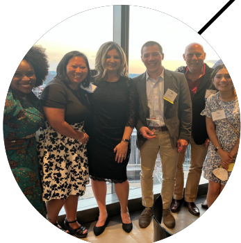
Washington Business Journal 40 Under 40 Event