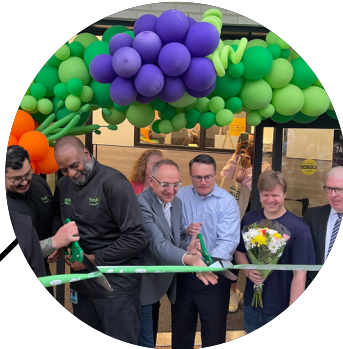
Ribbon cutting at Amazon Fresh Crystal City