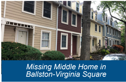
Missing Middle Home in Ballston-Virginia Square

On July 12, the Arlington County Board held a work session where they provided feedback to guide the next phase of the Missing Middle Housing Study. During the work session, the County Board asked County staff to draft zoning text and amendments that could meet several zoning requirements, parking requirements, and building design standards. This work session marked the end of Phase 2 of the study. Phase 3 will focus on additional public engagement and the drafting of zoning text and amendments.