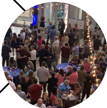
Association of Chamber Executives Annual Convention