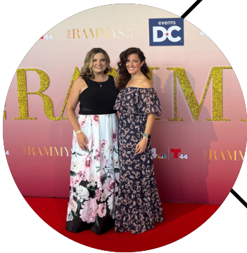
Restaurant Association of Metropolitan Washington's RAMMY Awards