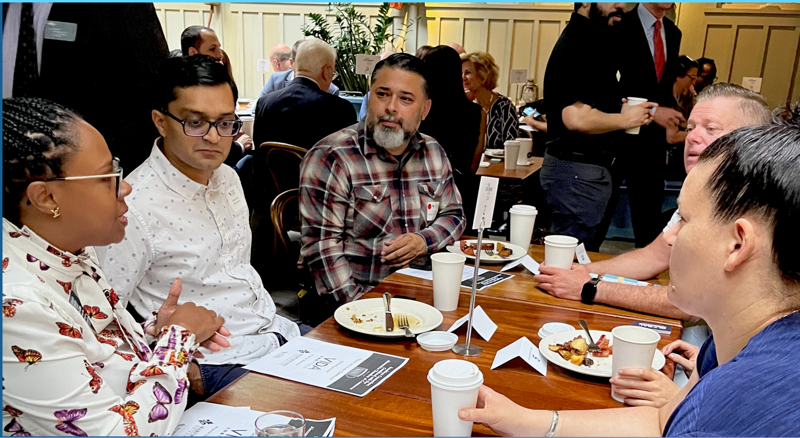
Breakfast Connection Combined with the Alexandria Chamber of Commerce

VOL. XCVIII NO. 5 SEPTEMBER/OCTOBER 2022