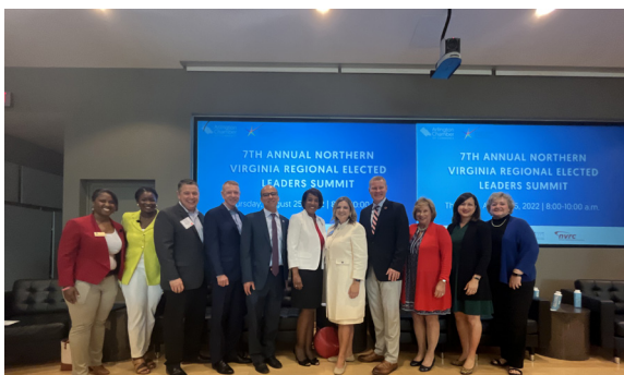
Chamber of Commerce CEOs and Panel