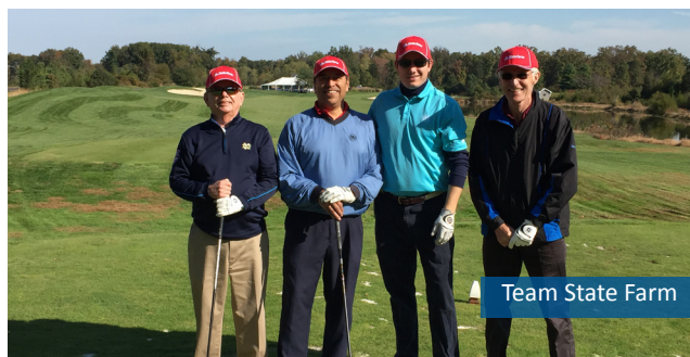
Team State Farm