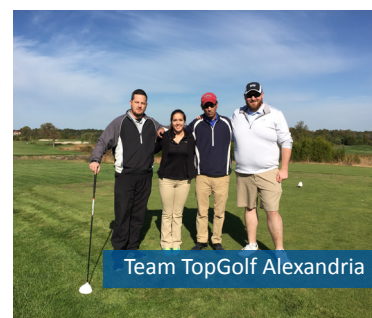
Team TopGolf Alexandria