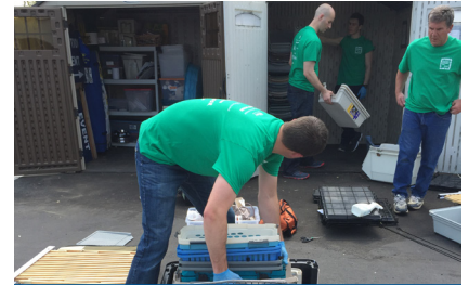
Volunteers from Segue Technologies and Bank of Georgetown organize supplies at Homeward Trails Animal Rescue.

Community Residences Culpepper Garden Homeward Trails Animal Rescue Linden Resources Phoenix Bikes The Reading Connection Red Cross National Capital Region