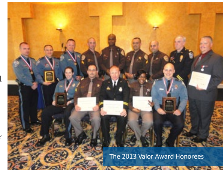
The 2013 Valor Award Honorees