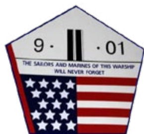
From the USS Arlington

The USS Arlington Commissioning Committee is still working to raise the approximately $100,000 needed to complete the 9/11 Tribute Room on the ship. This room, to honor those who lost their lives at the Pentagon on 9/11 and to recognize the efforts of the first responders, is empty.