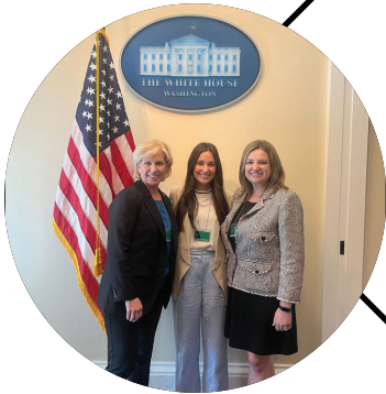
Technical Workshop on Space Systems Cybersecurity from the White House Office of the National Cyber Director