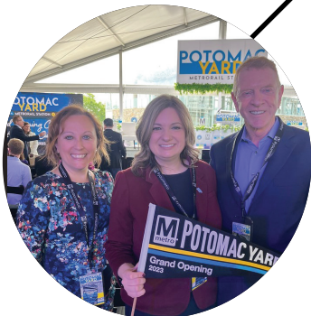
Potomac Yard Metrorail Station Grand Opening Ceremony & Ribbon Cutting