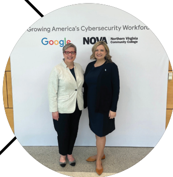
Northern Virginia Community College and Google's Workforce Development event