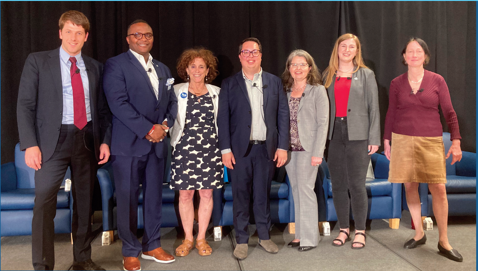
2023 Arlington County Board Candidate Forum

VOL. CI NO. 3 July/August/September 2023