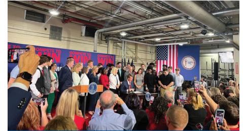
Governor Glenn Youngkin signing the workforce development consolidation bills.