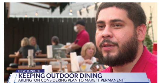
NEW TONIGHT KEEPING OUTDOOR DINING ARLINGTON CONSIDERING PLAN TO MAKE IT PERMANENT