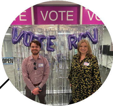
Open House and Celebration of the newly renovated Ellen M. Bozman Arlington County Government Center

The success of the Arlington Chamber is tied to its membership base. This is why the Chamber's Directors, staff, and members are dedicated to supporting community events and programs.