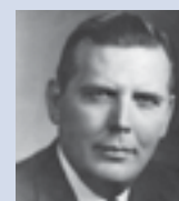
Joel Broyhill (posthumous award) Former Chair: 1952