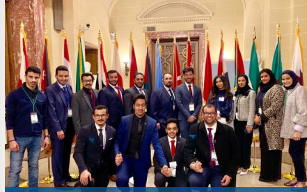
Marymount University Saudi Students Association (SSA)

The Saudi Arabian Cultural Mission to the USA recently named the Marymount University Saudi Students Association (SSA) as the third best Saudi Students Association in the United States among 300 Saudi Students Associations and number one in the Washington metropolitan area. This designation celebrates their highly effective participation inside and outside the Marymount University Community for the 2017-2018 school year.