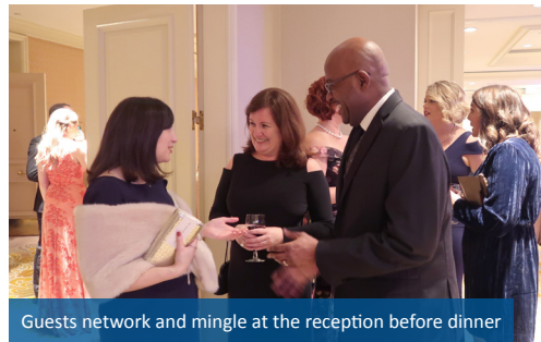
Guests network and mingle at the reception before dinner