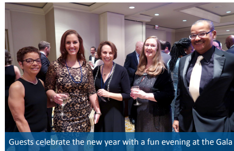
Guests celebrate the new year with a fun evening at the Gala