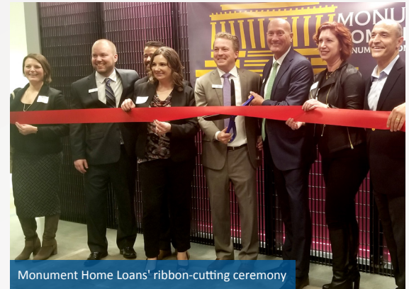
Monument Home Loans' ribbon-cutting ceremony