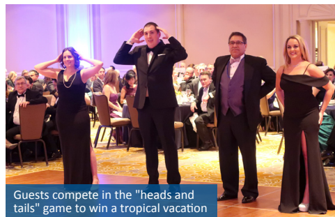
Guests compete in the "heads and tails" game to win a tropical vacation