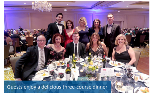
Guests enjoy a delicious three-course dinner