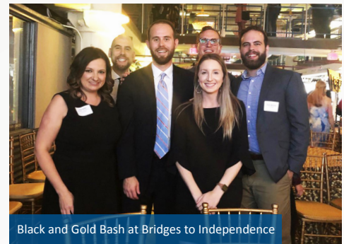
Black and Gold Bash at Bridges to Independence