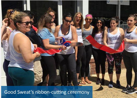
Good Sweat's ribbon-cutting ceremony

In many ways, the success of Arlington is directly tied to the success of its business community, and the success of the Arlington Chamber is directly tied to its membership base. This is why the Chamber's Directors, staff and members are dedicated to supporting community events and happenings. Below are highlights from a sampling of the events that Chamber staff and members of our Board of Directors participated in on behalf of the Chamber.