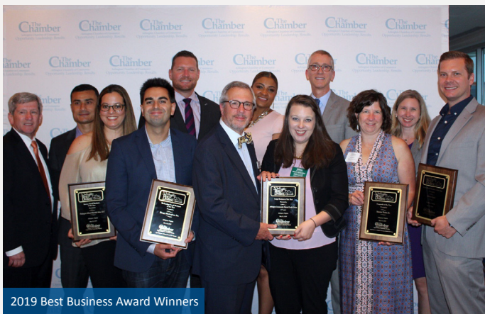
2019 Best Business Award Winners