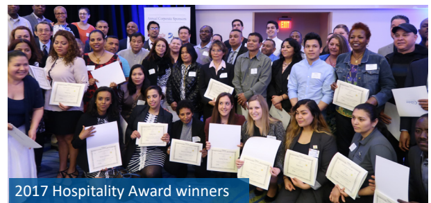
2017 Hospitality Award winners

Patron Sponsor Arlington Partnership for Affordable Housing