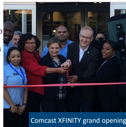
Comcast XFINITY grand opening