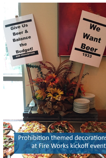
Prohibition themed decorations at Fire Works kickoff event.