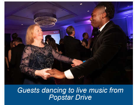
Guests dancing to live music from Popstar Drive