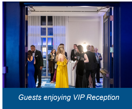
Guests enjoying VIP Reception