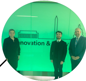
Chamber staff at Microsoft TechSpark event

The success of the Arlington Chamber is tied to its membership base. This is why the Chamber's Directors, staff, and members are dedicated to supporting community events and programs.