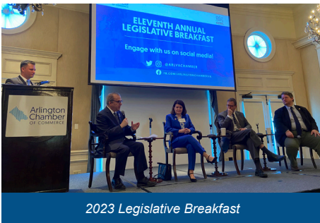
2023 Legislative Breakfast

In March, the Arlington Chamber of Commerce hosted its Annual Legislative Breakfast sponsored by Nestlé . The event - back in person for the first time since the pandemic - offered attendees the opportunity to hear about the recent General Assembly session from the legislators who represent Arlington in Richmond. Arlington's members of the Virginia Senate and House of Delegates discussed the legislation that they patroned, the issues that the General Assembly took up, and the outlook for Arlington and the Commonwealth of Virginia.