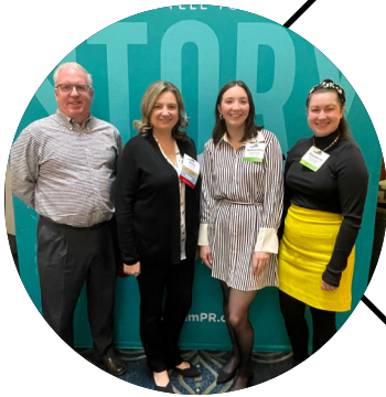
Chamber staff at VACCE Staff Development Conference