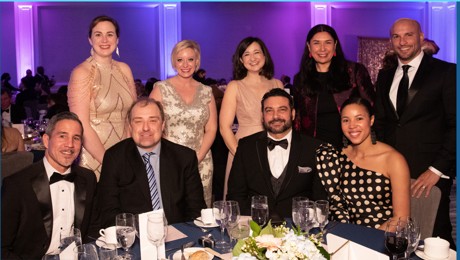
99th Annual Arlington Business Gala

special thanks to ARLINGTONIAN GRAND SPONSOR