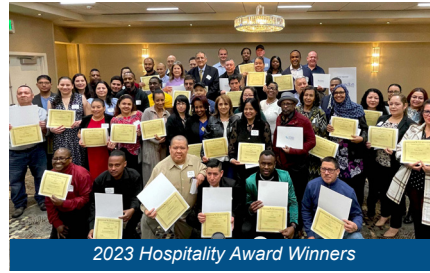
2023 Hospitality Award Winners