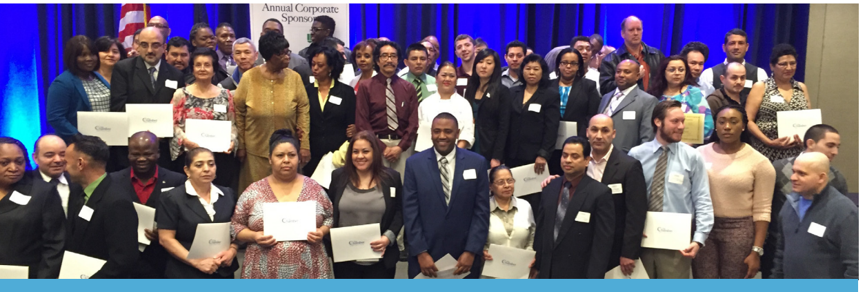
2015 Hospitality Superstars